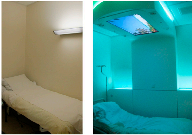
FIGURE 1. (Left) Uptake room without audiovisual installation (control). (Right) Uptake room with audiovisual installation (intervention).

assist the nuclear medicine physician with 18 F-FDG injection. The control panel, positioned directly outside the uptake room, let the staff control the audiovisual installation.